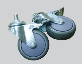
LOCKING CASTERS The heavy duty locking casters allow the carton sealer quick and easy mobility to other locations.