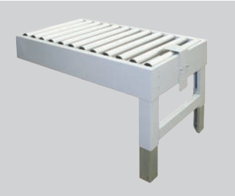
LONG INFEED/EXIT CONVEYOR W/ L-BRACKET STABILIZER

Order a spare tape head with your machine to minimize down time. Having a spare will allow you to drop in a tape head with a new roll of tape in no time!