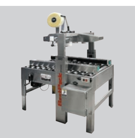
FOOD GRADE 304 STAINLESS STEEL This machine is available in 304 stainless steel which is food grade safe for food applications.