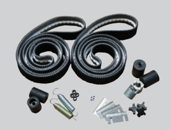
SPARE PARTS KIT "Spare Parts Kits may vary based on machine" Minimize downtime with BestPack's Spare Parts Kit.

This 39.5" long conveyor is a great work platform and allows for staging of cartons on the infeed and the exit.