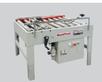
INDEXER STATION The indexer's function is to separate and time cartons going into the carton sealer.

The low tape light allows the operator to prepare a new roll of tape. The no tape alarm will inform the operator of the error so that the carton may be resealed.