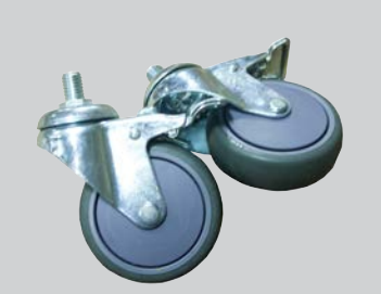
LOCKING CASTERS The heavy duty locking casters allow the carton sealer quick and easy mobility to other locations.