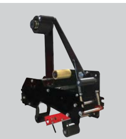
SPARE TAPE HEAD Order a spare tape head with your machine to minimize down time. Having a spare will allow you to drop in a tape head with a new roll of tape in no time!