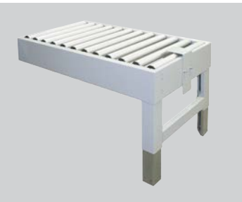
SHORT OR LONG INFEED/EXIT CONVEYOR W/ L-BRACKET STABILIZER This 19.75" short or 39.5" long conveyor is a great work platform and allows for staging of cartons on the infeed and the exit.