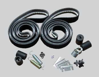
SPARE PARTS KIT "Spare Parts Kits may vary based on machine" Minimize downtime with BestPack's Spare Parts Kit.